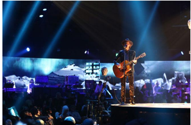
Beck – Live performance of Sound and Vision (2013)

Don't you wonder sometimes About sound and vision?